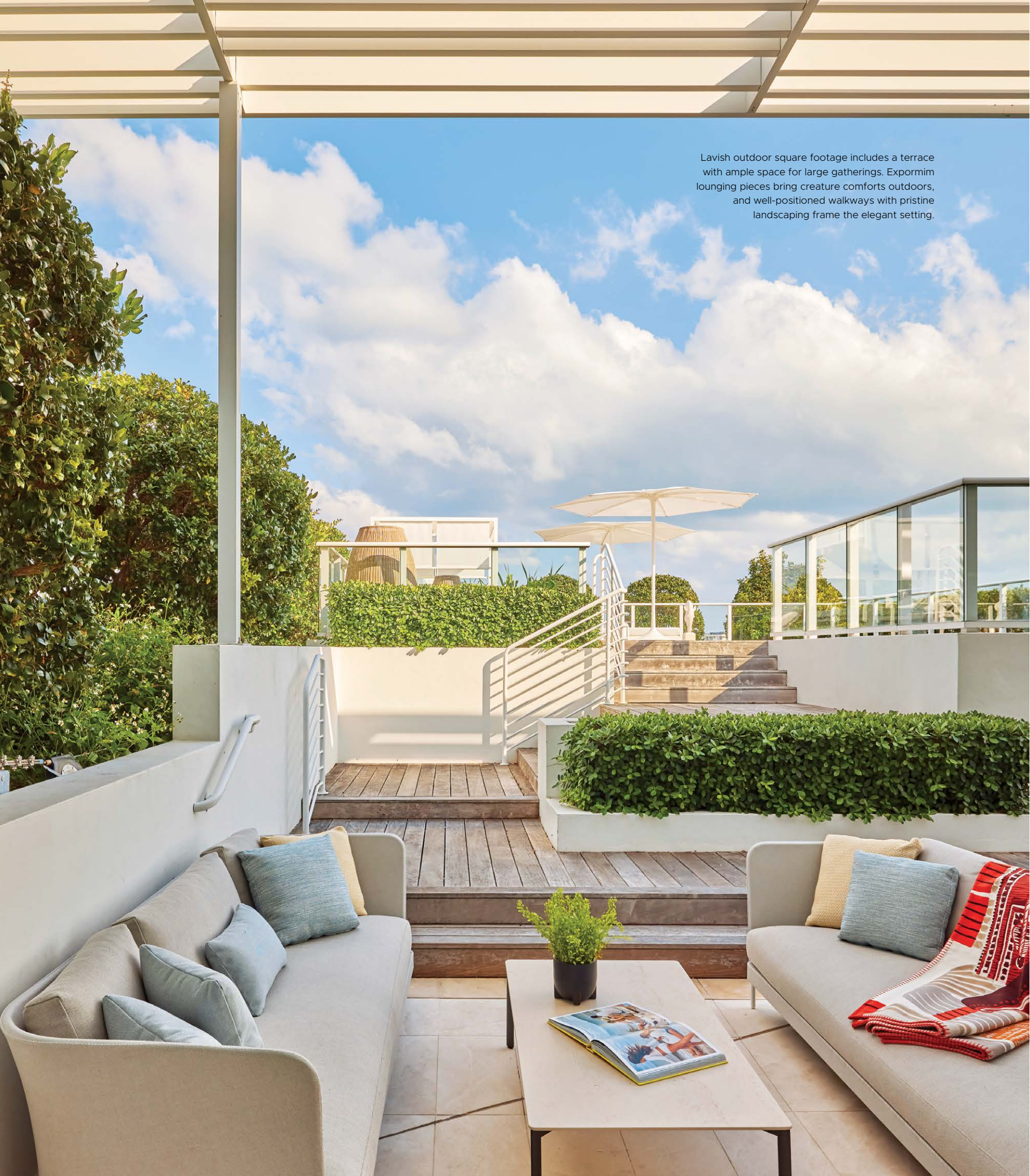
Lavish outdoor square footage includes a terrace with ample space for large gatherings. Expormim lounging pieces bring creature comforts outdoors, and well-positioned walkways with pristine landscaping frame the elegant setting.

The winning touch? A sinuous plaster headboard designed by Britto Charette and handcrafted by Art Space NYC. When they first walked the space with their clients, Charette instinctively knew it could accommodate a monumental design element, so he envisioned a sculptural headboard inspired by Hellenistic marble sculptures emulating wet fabric in the wind on feminine forms. The headboard also creates an acoustic separation, buffering any plumbing and mechanical noise from the vertical stack.