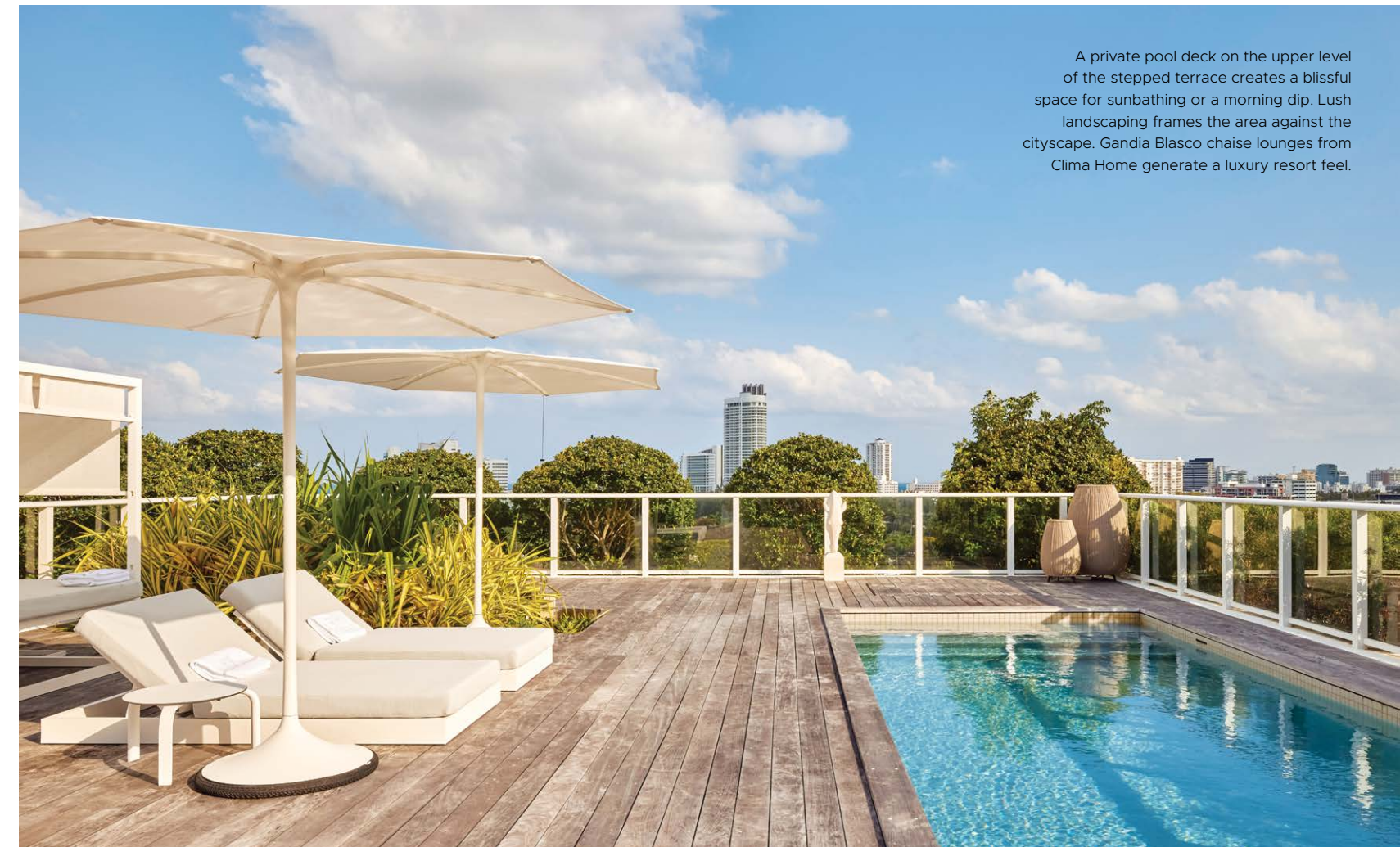
A private pool deck on the upper level of the stepped terrace creates a blissful space for sunbathing or a morning dip. Lush landscaping frames the area against the cityscape. Gandia Blasco chaise lounges from Clima Home generate a luxury resort feel.

“We’re often thrown curveballs, so we find ways to transform those challenges into custom design elements,” notes Charette. “The clients realized the value a well-executed interior design could bring to their enjoyment of the property. Hence, our favorite aspect was delivering the finished design and seeing them enjoy it.”