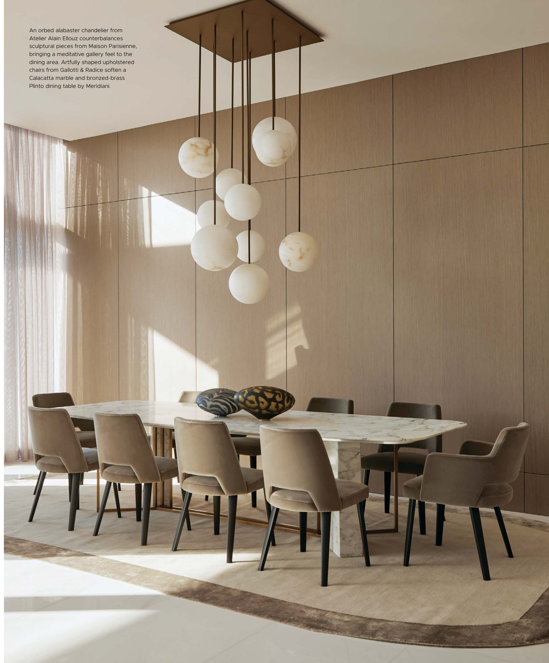
An orbbed alabaster chandelier from Atelier Alain Ellouz counterbalances sculptural pieces from Maison Parisienne, bringing a meditative gallery feel to the dining area. Artfully shaped upholstered chairs from Gallotti & Radice soften a Calacatta marble and bronzed-brass Plinto dining table by Meridiani.

LEFT: A custom bar area tucks discreetly into a well-appointed nook in the great room. The design melds with the room’s sophisticated aesthetic while providing a functional cocktail station for effortless entertaining. Polished marble frames a fluted wood embellishment and then continues on the wall and countertops.