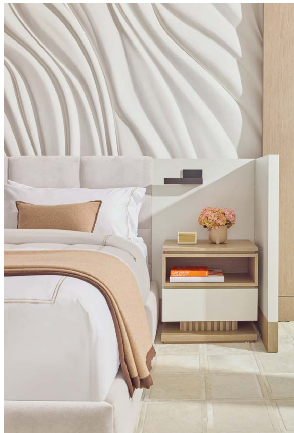
LEFT: A custom headboard designed by Britto Charette was handcrafted in plaster by Art Space NYC. Transported in five non-linear sections, the piece draws inspiration from Hellenistic marble sculptures emulating flowing fabric on feminine forms. Romo velvet lines the headboard below the plaster element, lending textural contrast.