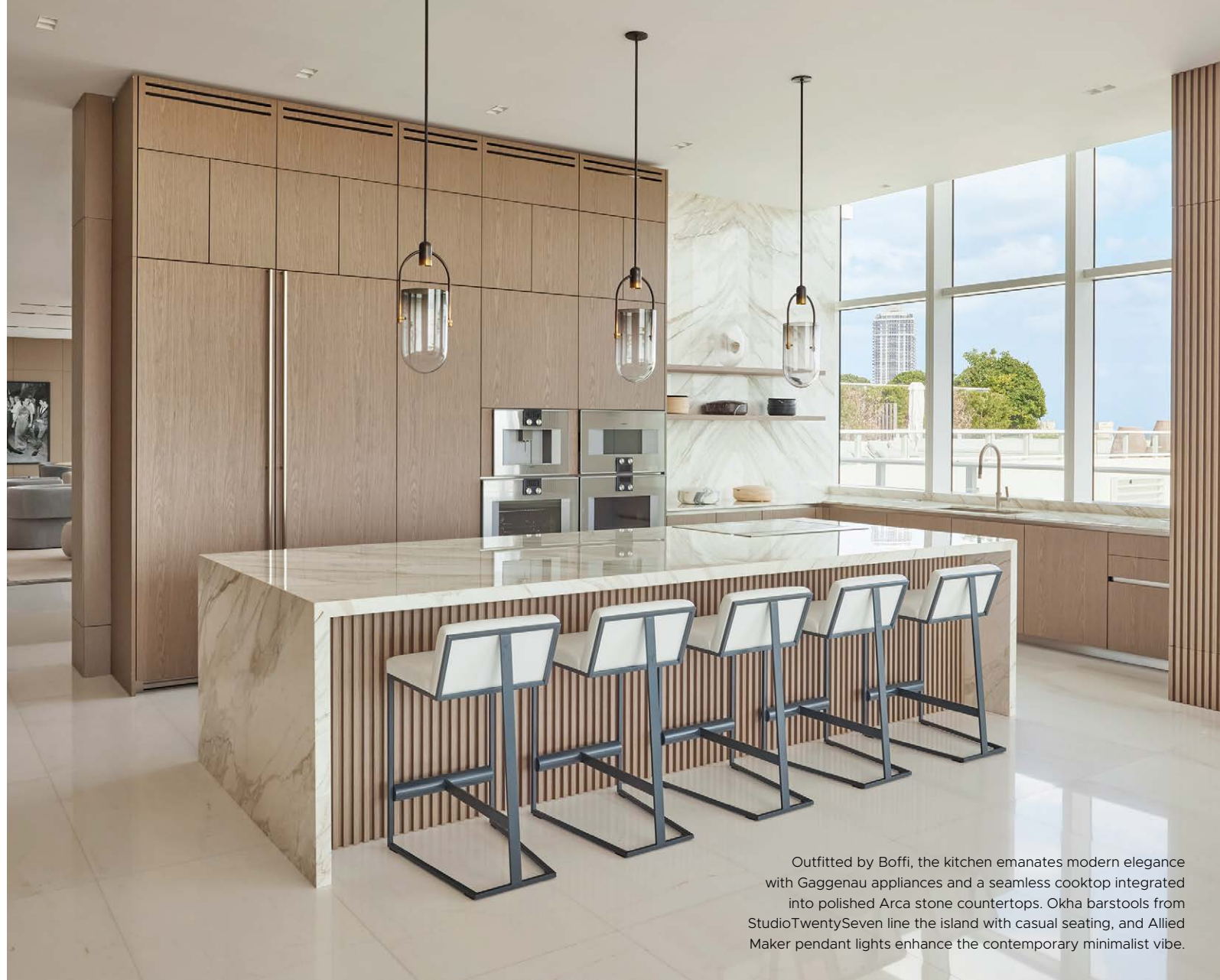
Outfitted by Boffi, the kitchen emanates modern elegance with Gaggenau appliances and a seamless cooktop integrated into polished Arca stone countertops. Okha barstools from StudioTwentySeven line the island with casual seating, and Allied Maker pendant lights enhance the contemporary minimalist vibe.